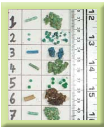
Figure 1 ~ Metarex bait (Row 5) showing superior weather resistance compared to ordinary baits when subject to 75mm of simulated rainfall.

This document sets the record straight on why metaldehyde is an effective compound to control snails and slugs, and outlines why Metarex is the best formulation to achieve and deliver results.