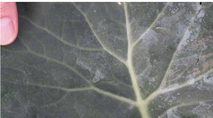
Without Du-Wett - deposition patchy