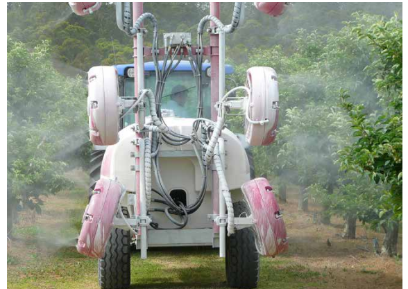
Du-Wett enhances spreading and foliage deposition.