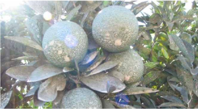
Surround applied in 2000 L water/ha (no adjuvant)